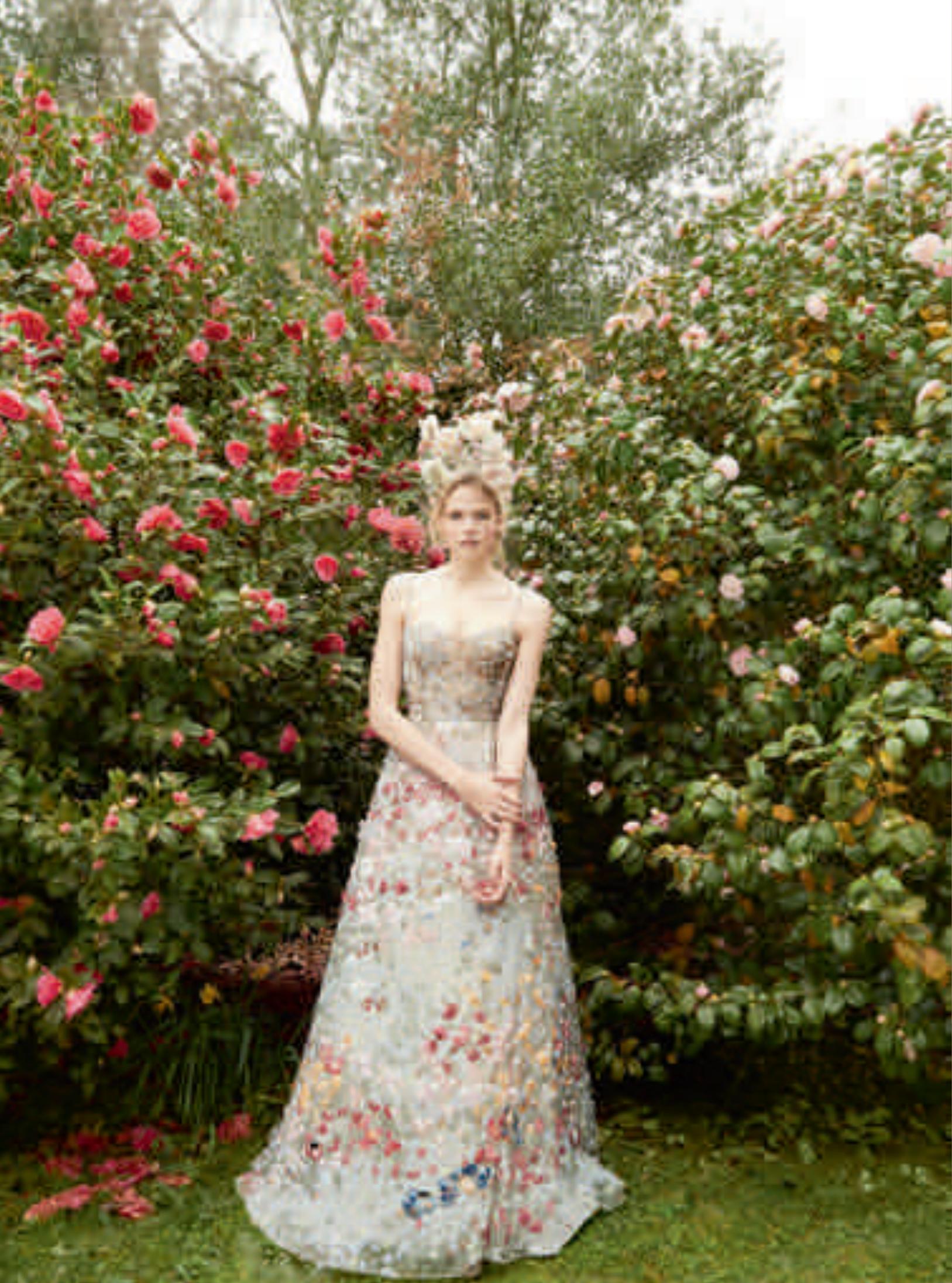
This page: embroidered tulle dress; feather headdress; tulle and velvet mules, all Dior Haute Couture. White gold and diamond earrings; white gold and diamond ring, both Dior Joaillerie. Opposite: embroidered tulle dress; silk headdress, both Dior Haute Couture. Gold, diamond and peridot earrings, £12,000; white gold and yellow diamond ring, both Dior Joaillerie