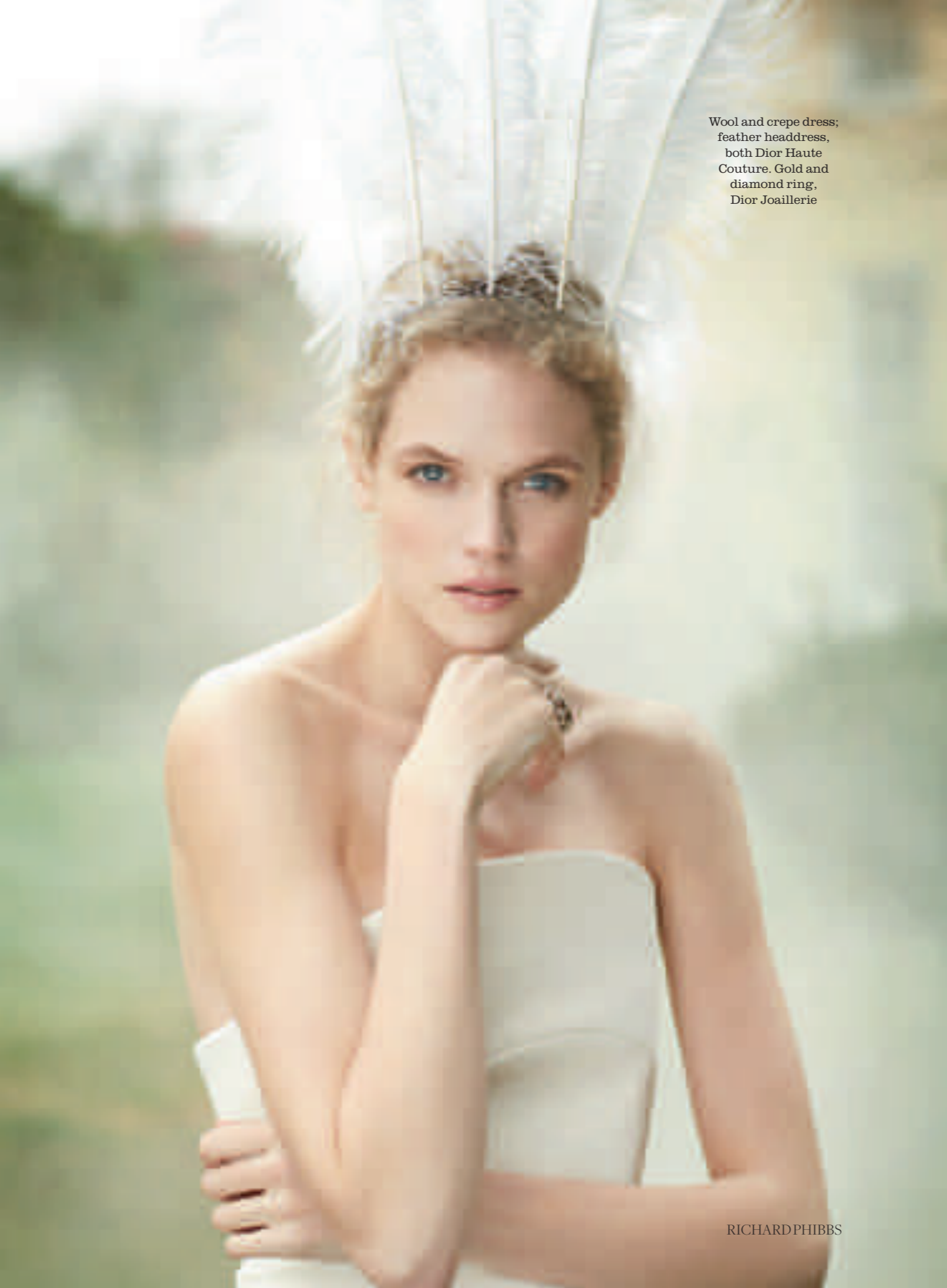
Wool and crepe dress; feather headdress, both Dior Haute Couture. Gold and diamond ring, Dior Joaillerie